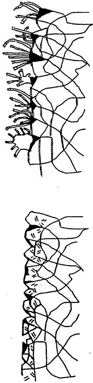
(d) Filaments develop from the catalytic particles